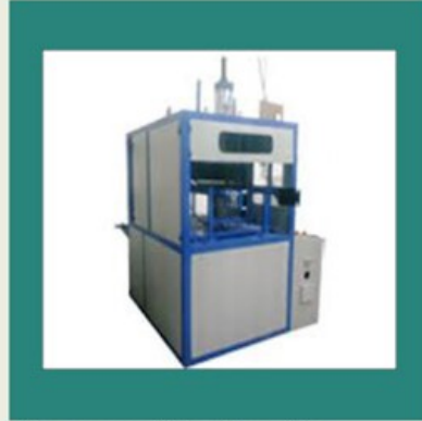
Vacuum Machine for Packaging