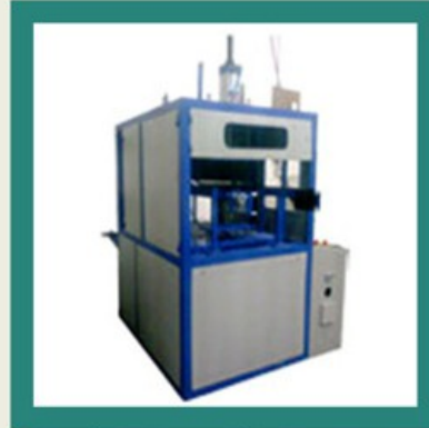
Semi Automatic Vacuum Forming Machine