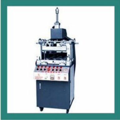
Industrial Bending Machines