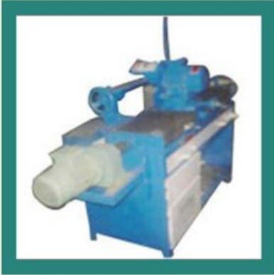
Automatic Blade Sharpening Machine