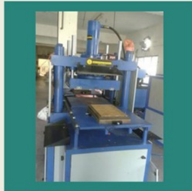
Sealing Cutting Machine