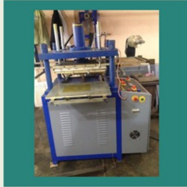
Emboss Hot Foiling Machine