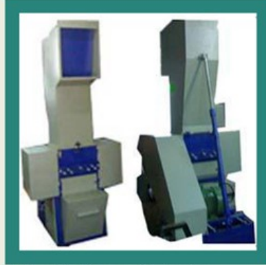
Plastic Scrap Grinder Machine