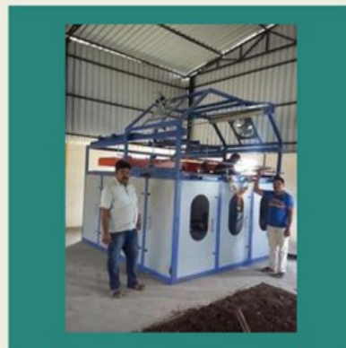
Large Manual Vacuum Forming Machine