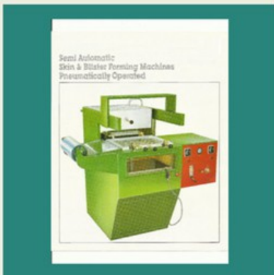
Special Purpose Vacuum Forming Machines