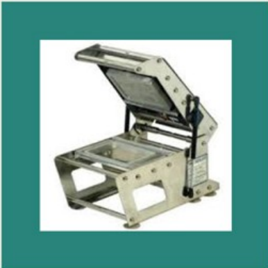
Sealing Machine for Industries