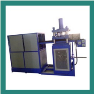
Automatic Vacuum Forming Machines