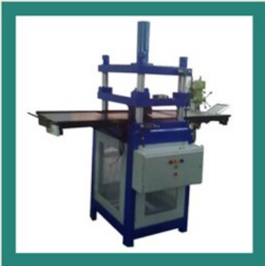
Hydraulic Press Blister Cutting Machine